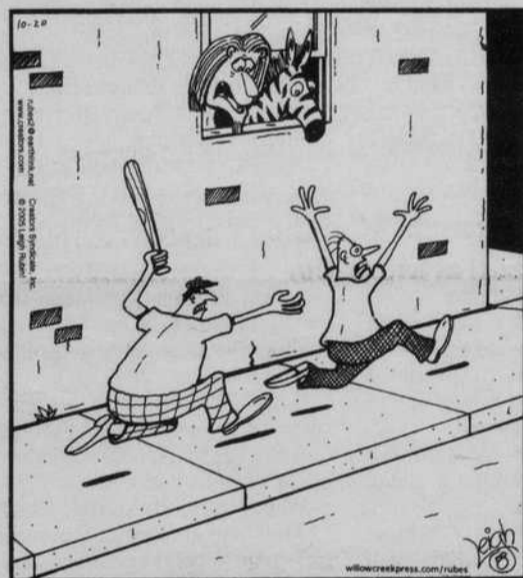
"It's difficult being a dispassionate observer, but we must let nature take its course."