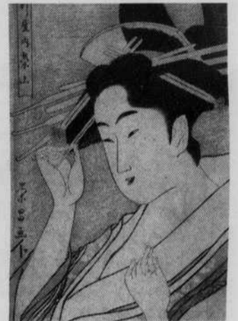
Chōkōsai Eishō, Eizan of the Takeya, c. 1790s, on loan from the Weatherspoon Art Museum, the University of North Carolina at Greensboro.

Location: 1430 Johnson Lane on the University of Oregon campus.