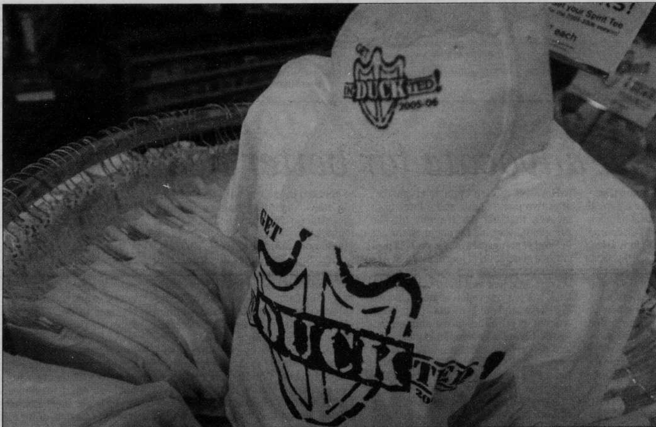
T-shirts with the winning slogan, "get inDUCKted," are now on sale in the University Bookstore.