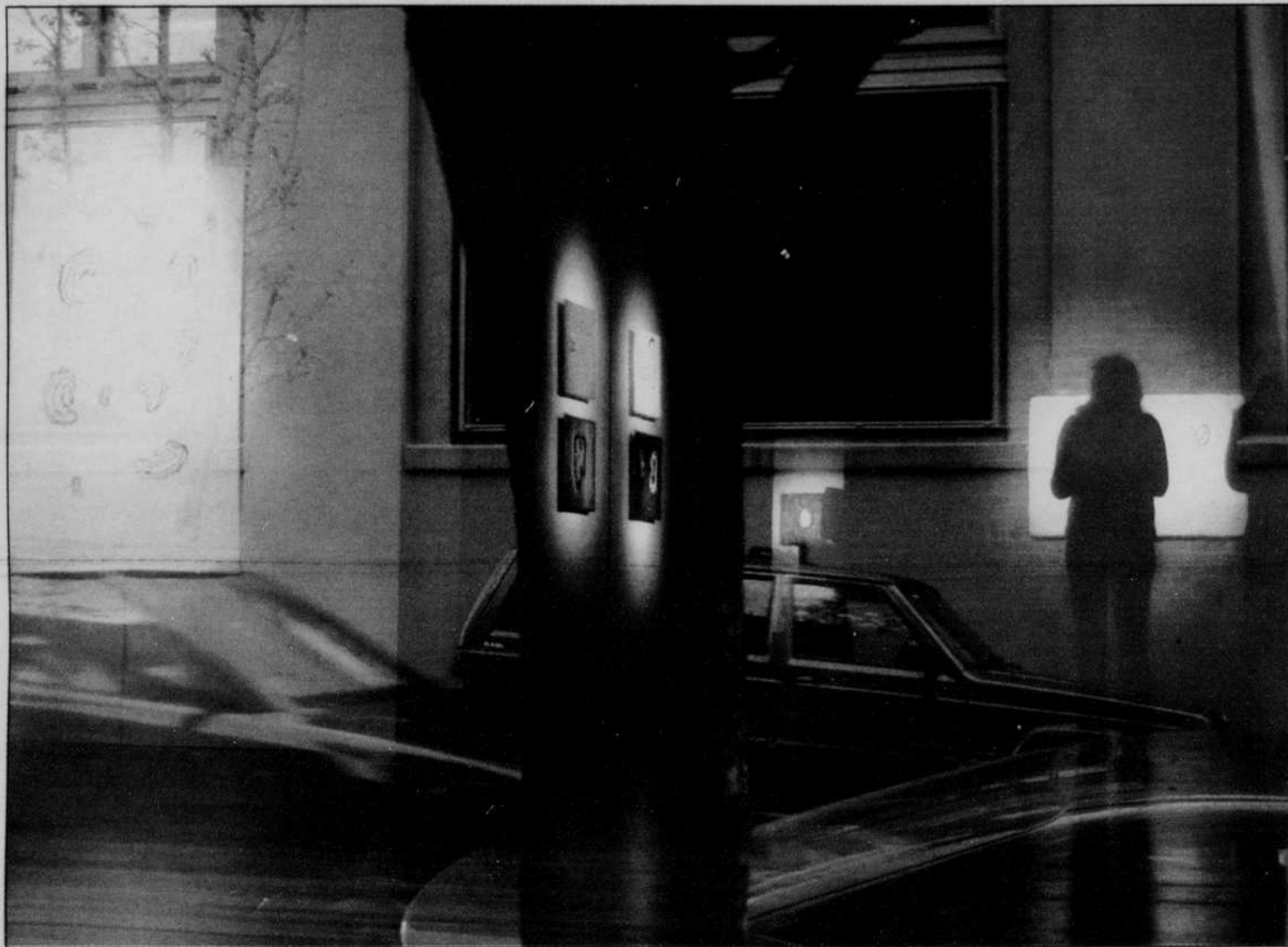
A gallery in the Portland Pearl District displays contemporary art.