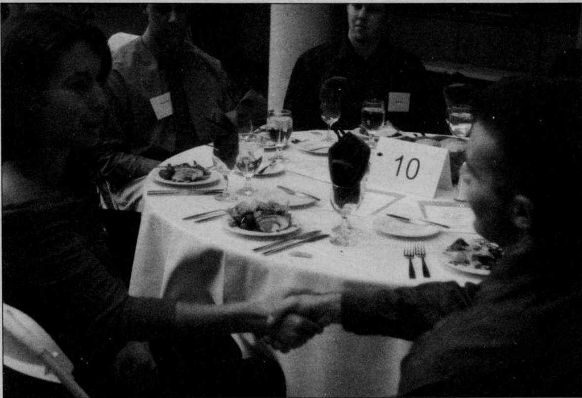
NICOLE BARKER | PHOTOGRAPHER