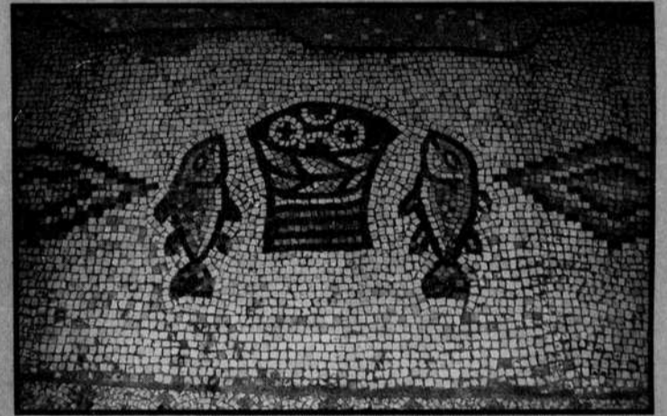
Fish and leaves scene from mosaic floor of late Constantinian church at Tabgha, near Capernaum

The University of Oregon Department of Religious Studies presents the 2004-5 Gaston Lecture in Christianity