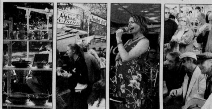
Local handcrafts direct from the artists, international foods made fresh on site, live entertainment all day long, and the best people watching in town...