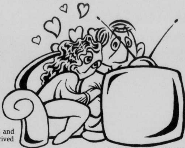
BRET FURTWANGLER | GRAPHIC ARTIST

For Valentine's Day critics, there are plenty of movies involving little romance or dysfunctional relationships — the perfect antidote to Valentine's Day disgust.