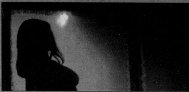
John Henry's will host its weekly burlesque show Sunday.