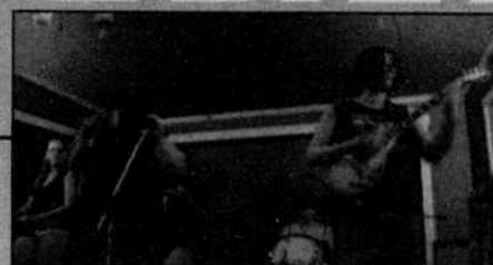
The Shudders will perform at John Henry's on Friday