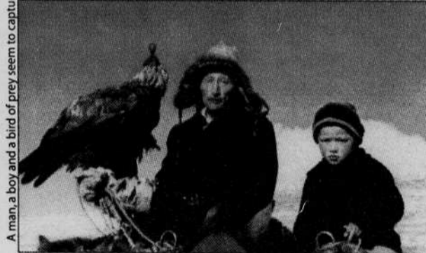
A man, a boy and a bird of prey seem to capture