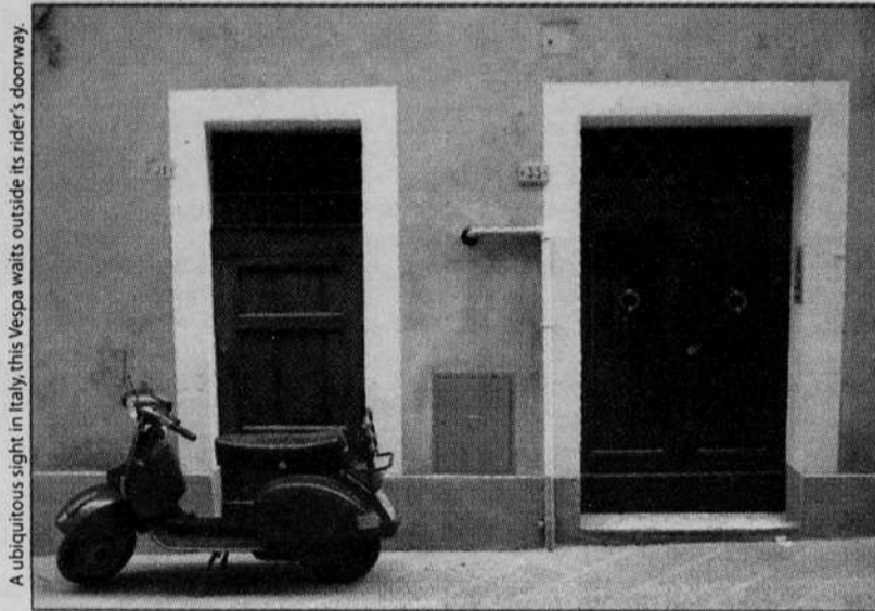
A ubiquitous sight in Italy, this Vespa waits outside its rider's doorway.