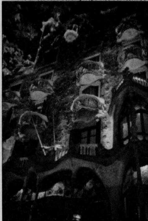
This famous Gaudi building in Spain looks almost like a