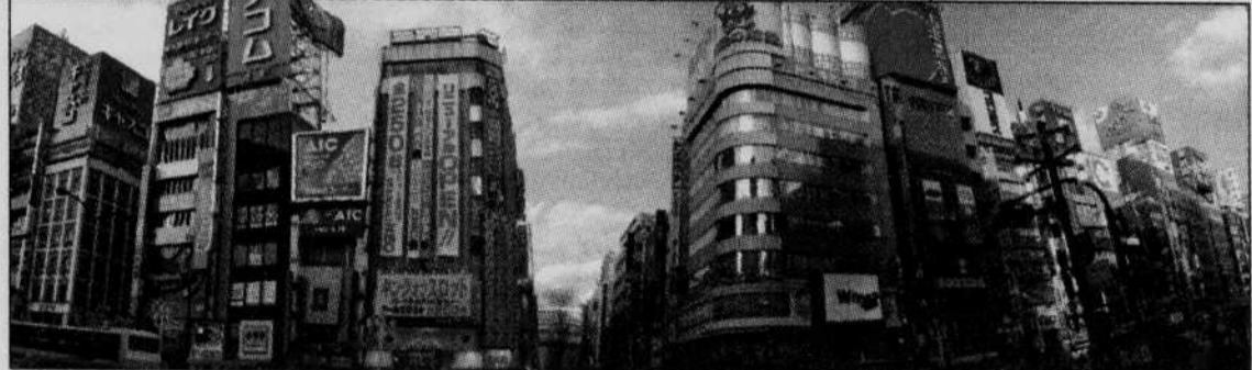
The Shinjuku shopping district of Tokyo dazzles newcomers with its array of colors.