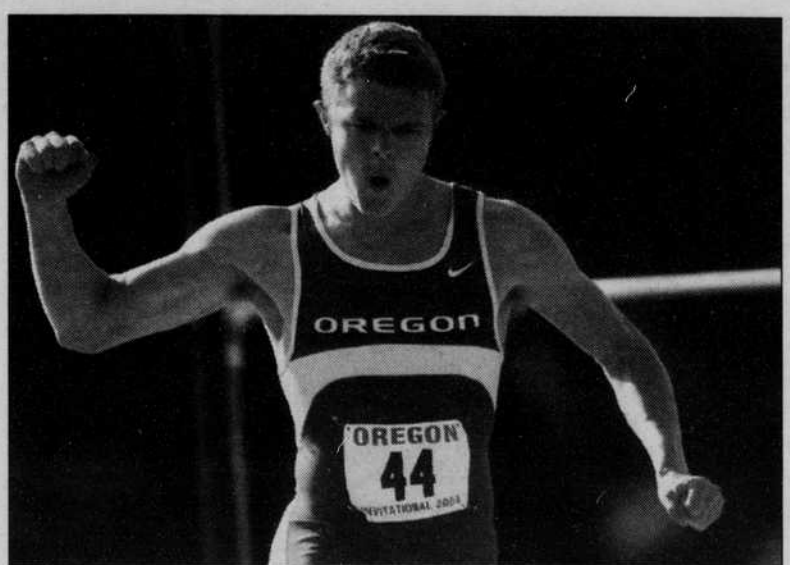
Danielle Hickey Photo Edito