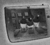
airpanel Smart Displays