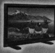
Plasma TV Displays