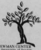
NEWMAN CENTER at University of Oregon

Visit our Web site newmanctr-uoregon.org or send us an e-mail to newman@newmanctr-uoregon.org