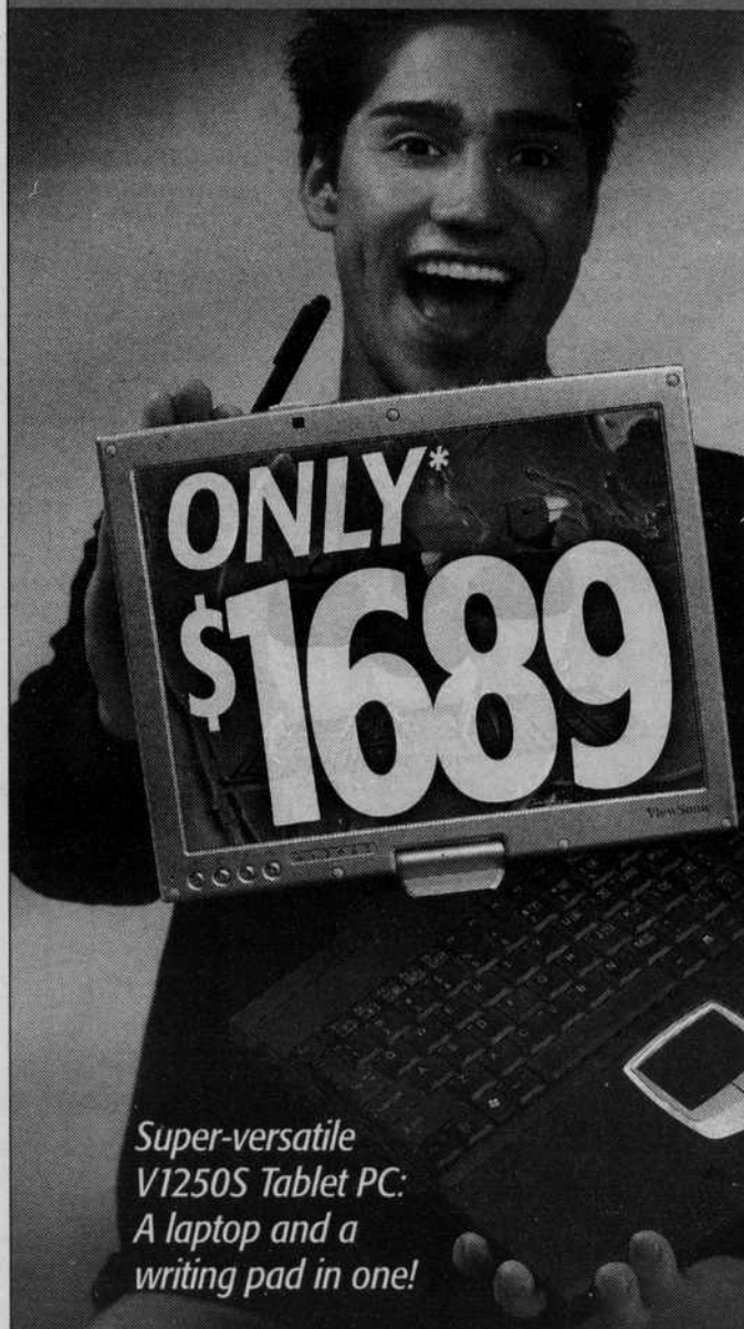
Super-versatile V1250S Tablet PC: A laptop and a writing pad in one!

Attention Duck Students, Faculty and Staff: