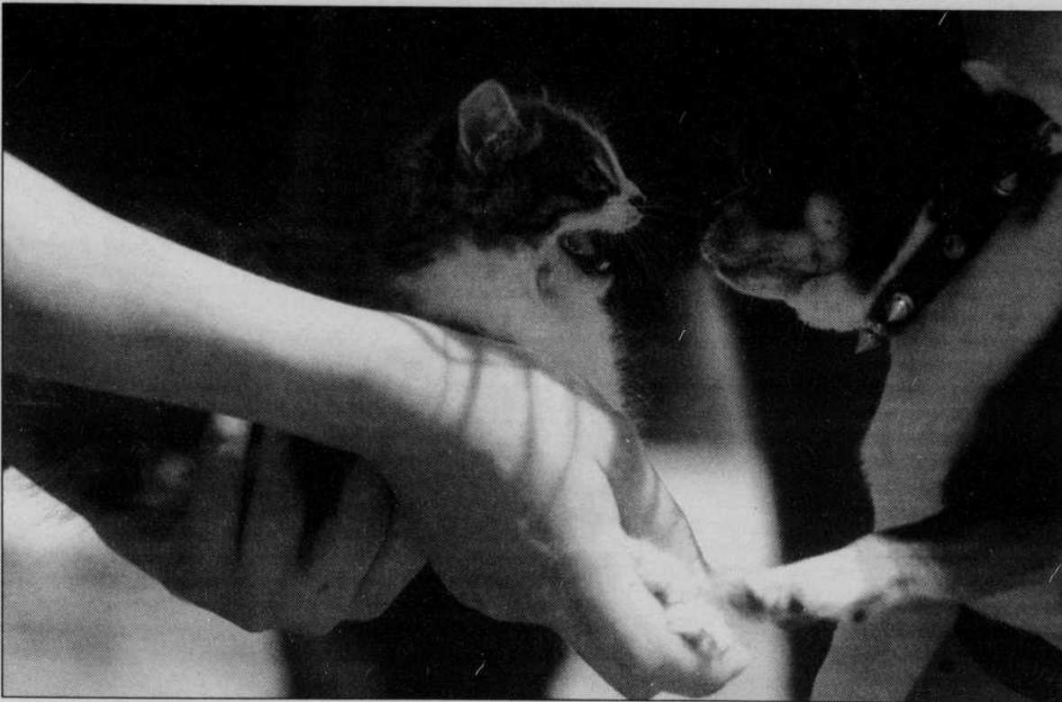
Seven-week-old Holmes (left) meets 3-and-a-half-year-old Luscious on Monday afternoon in the EMU Amphitheater.