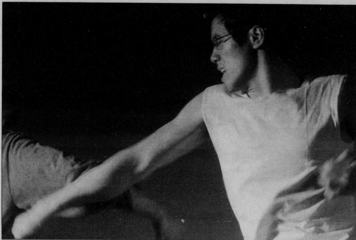
Lauren Wimer Senior Photographer

$7 Students—$8 General Admission (tickets available at the EMU ticket office).