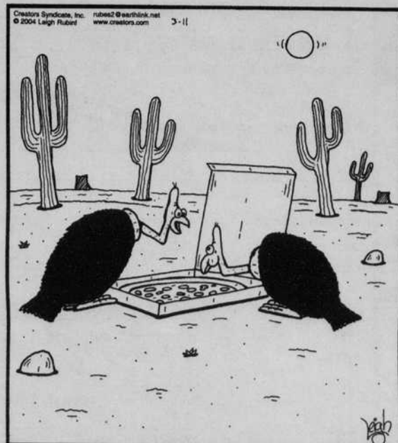
"Isn't this marvelous?! It's warm, gooey and flat ... Just like road kill, but with all of your favorite toppings!"