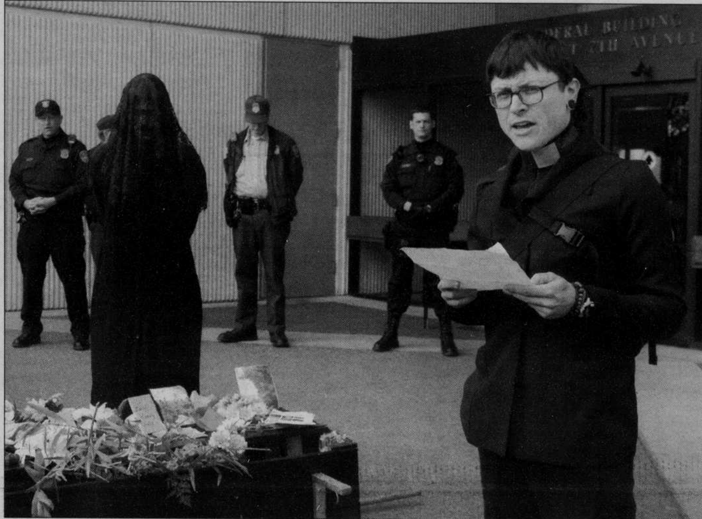
Protestors hold a mock funeral procession Monday morning in front of the Federal Building to protest new old-growth regulations. Praxis (right) delivers a speech as another protester stands in silence. The rally was one in a series of nine held in West Coast cities to protest the changes.