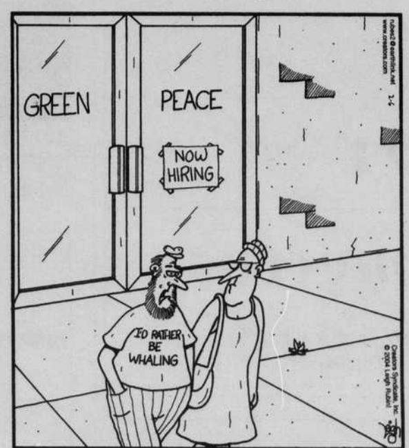
"I don't think I got the job. It's as if they had their minds made up before we even started the interview."

Check the pages in the Emerald for today's crossword solutions.