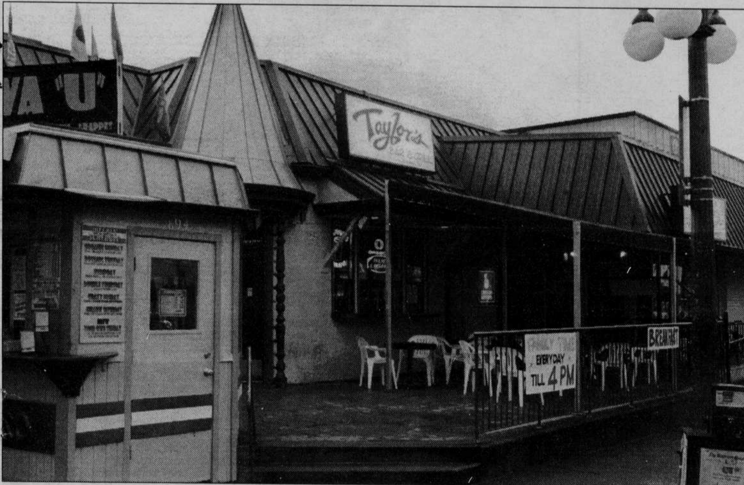
Taylor's Bar and Grill, located at 894 E. 13th Ave., recorded 16 calls for fights or assaults in 2002 and 2003.