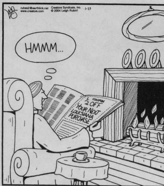
Thomas Jefferson, respected president, savvy shopper.