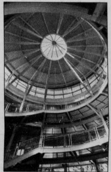
The Lillis Business Complex is the largest privately funded University academic building ever and was designed to complement the Charles H. Lundquist College of Business' team-based curriculum.