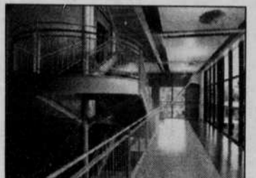
The spiral staircase on the building's west side is one of the many features of the $41 million Lillis Business Complex designed by SRG Partnership.