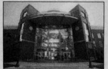
The Lillis Business Complex will be a model in sustainable design for the Pacific Northwest and provide much-needed quality classroom space for the wider University community.