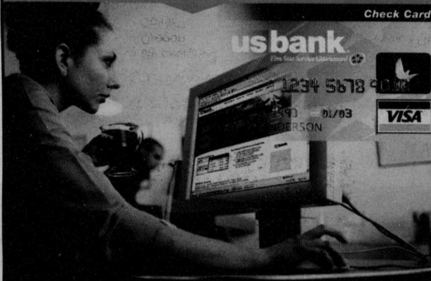
INTERNET BANKING & CHECK CARD