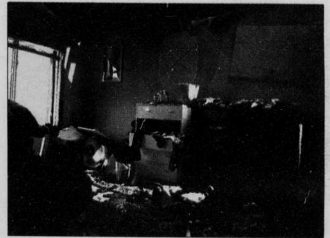
Jessica Waters Emerald

The blaze started on the third floor sun deck on the east side of the building. The flames eventually engulfed two third-story