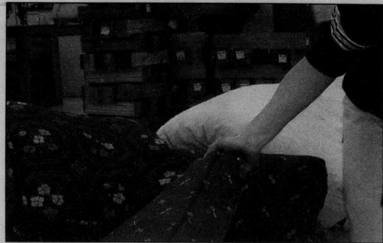
Goodwill industries is just one place to find used furniture at a reasonable price; others include Salvation Army and St. Vincent DePaul. Emerald