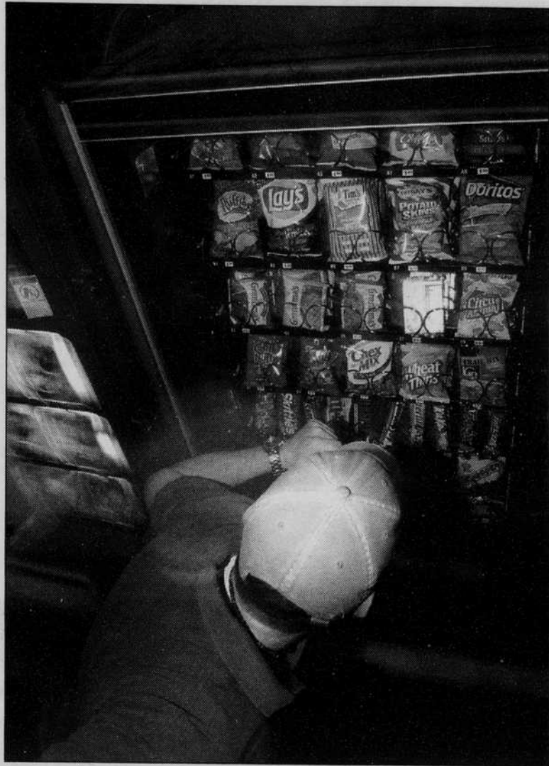
DPS has received 25 reports of vending machine vandalism since last September, and DPS and EPD have tracked down a suspect.

Contact the reporter at caronalarab@dailyemerald.com.