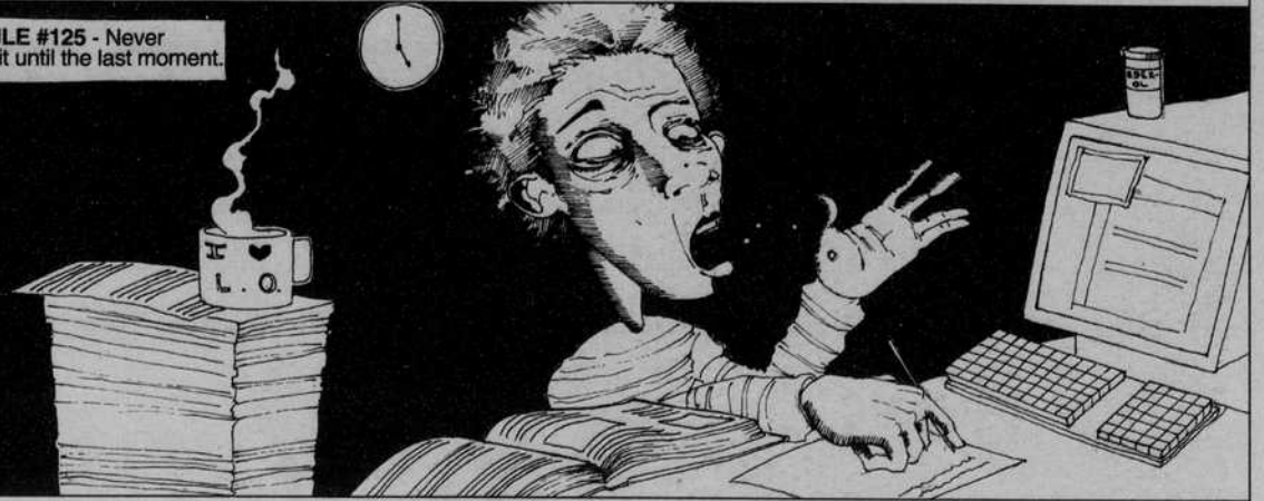
Tyler Wintermute Emerald

RULE #125 - Never wait until the last moment.