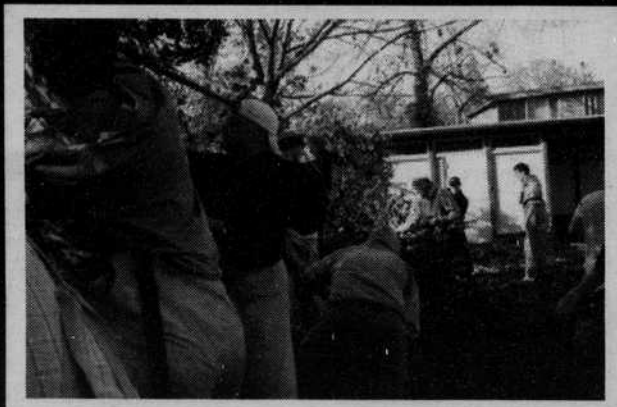
Members of Kappa Sigma fraternity show us that volunteering can help clean up the community.