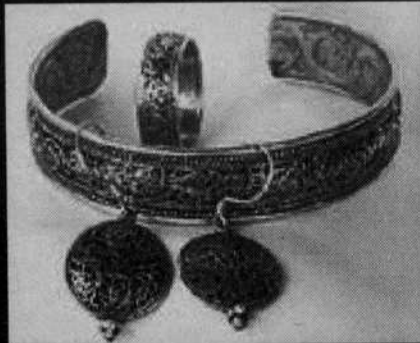
STERLING SILVER FILIGREE RING BRACELET & EARRINGS FROM NEPAL

ethnic sterling SILVER & semiprecious stones earrings bracelets pendants necklaces & such