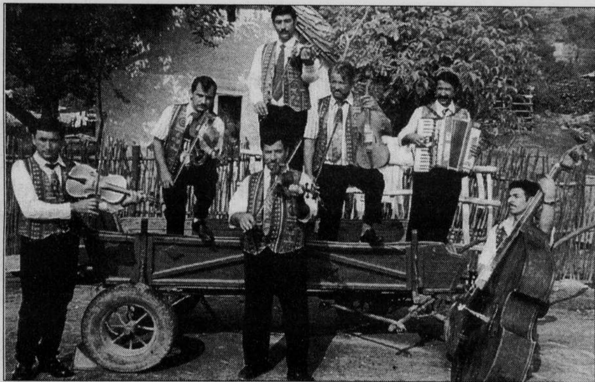
Szászcsávás, a group of related musicians, hails from Transylvania.