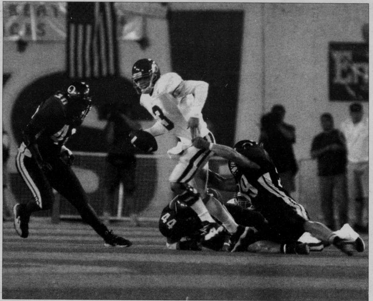
Quarterback Carson Palmer (3), back for his fifth season at USC, leads the Trojans into battle against Auburn on Saturday.