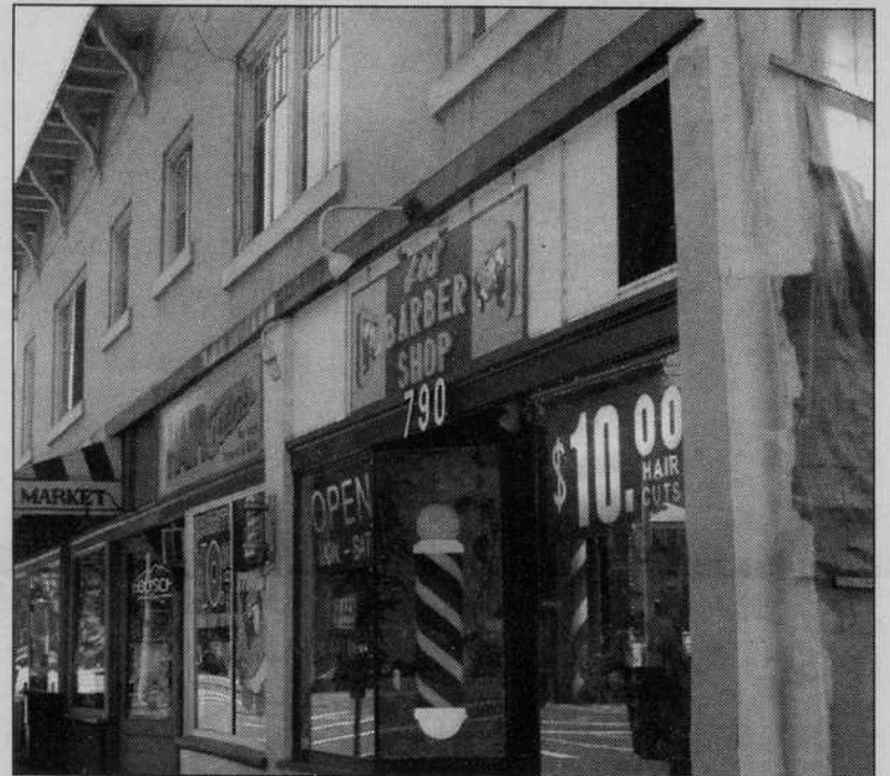
Adam Jones Emerald

Wheeler Properties, LLC has issued eviction notices to the tenants of the building at East 11th Avenue and Alder Street in order to demolish the building.