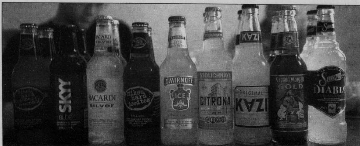
Adam Jones Emerald

Whatever you call them, the wide range of sweetened, flavored, alcoholic malt beverages now on the market are in a class of their own.