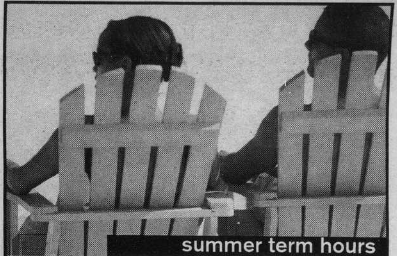
summer term hours