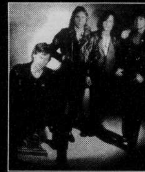
JOHN KAY & STEPPENWOLF AUGUST 23 & 24

ON THE BEACH IN LINCOLN CITY, OREGON TICKETS ON SALE 60 DAYS IN ADVANCE, 800-992-TIXX • 888-MAIN ACT • 996-5825