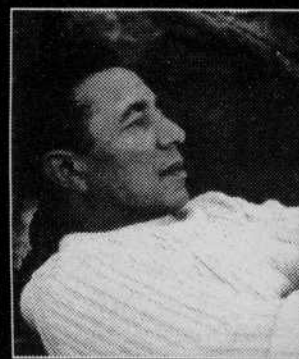
SMOKEY ROBINSON JULY 19 & 20