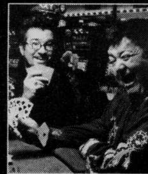
WILLIAMS & REE AUGUST 9 & 10