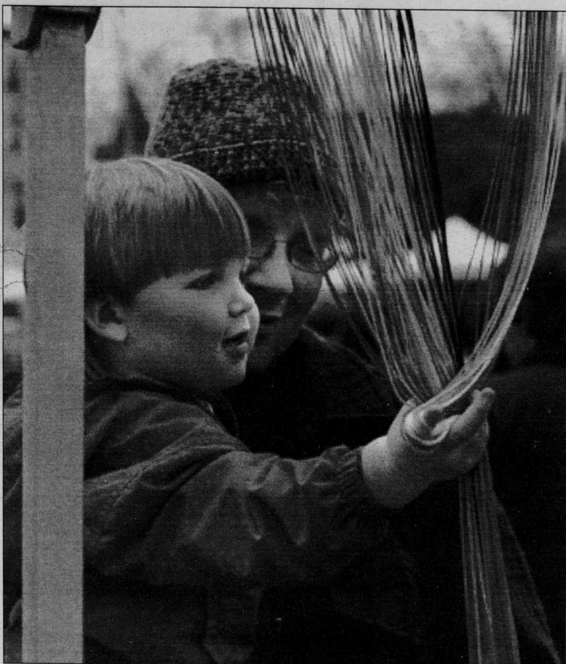
A sign reading 'Please Touch' accompanies this stand that attracts the curious to play with its rainbow strands.