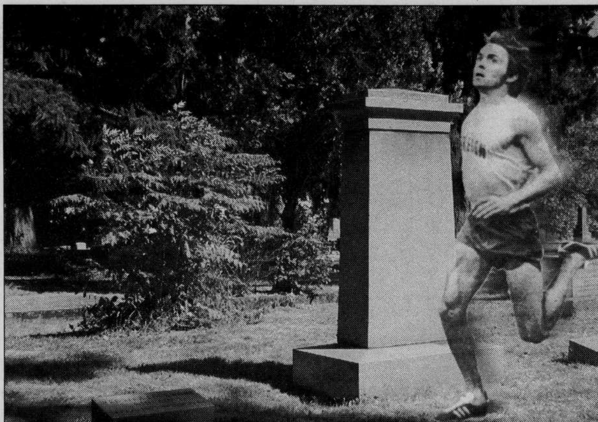
Cappi Farquar Emerald

Mick Jagers has circulated photographs — like the one above — that 'capture the ghost of Steve Prefontaine' running through the Pioneer Cemetery. Jagers also sells other 'proof,' including plaster castings of Pre's footprints and pieces of tattered shoe laces.