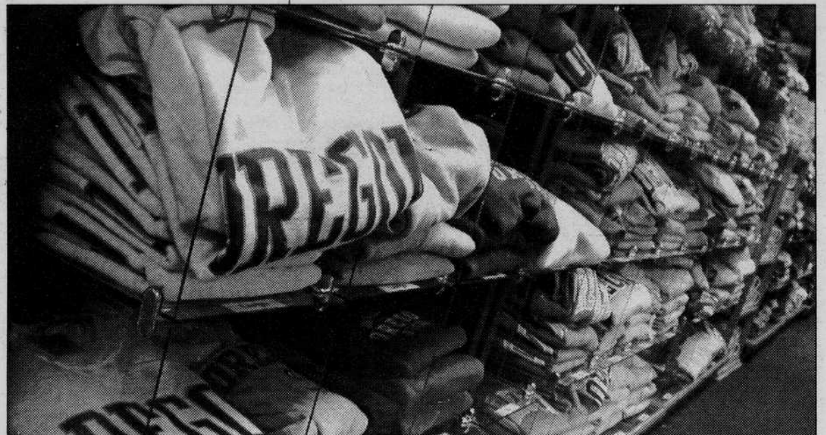
Henry Flower Emerald Duck crap once abounded on the first floor of the UO bookstore. Student groups at the University are recommending that the store use the vast amount of newly created floor space for an indoor running track, a sweatshop or books.