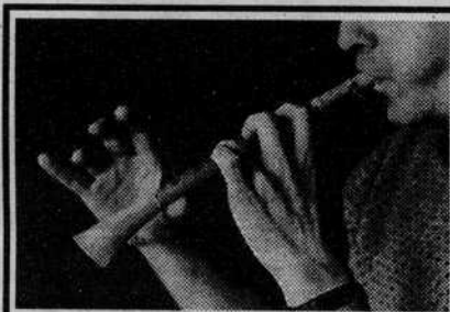
The "Falster-pipe," reconstructed from an 11th-century fragment found at an archaeological site in Falster, Denmark.

Hurry! Application deadline is Friday, March 15!