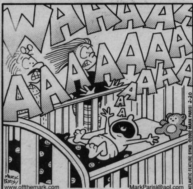
A YOUNG PHIL SPECTOR DEVELOPS HIS FAMOUS "WALL OF SOUND"