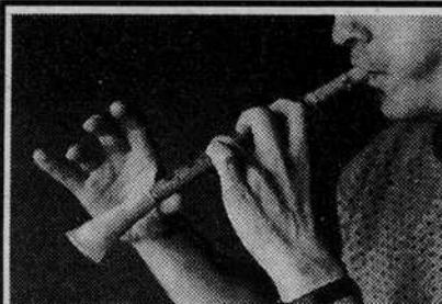
The "Falster-pipe," reconstructed from an 11th-century fragment found at an archaeological site in Falster, Denmark.

Hurry! Application deadline is Friday, March 15!