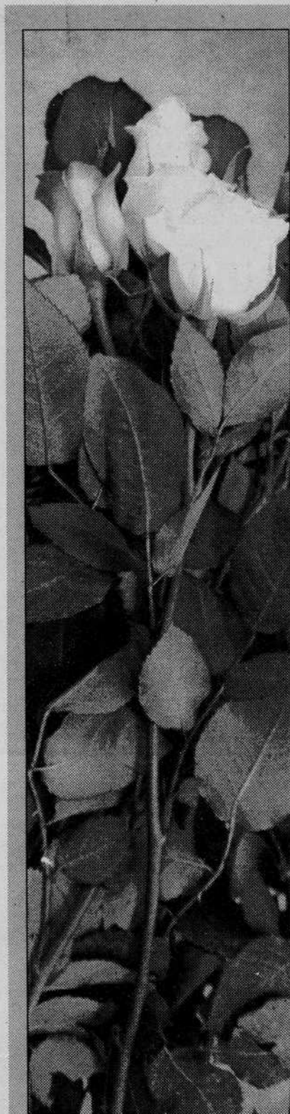
Jonathan House Emerald

While bi-colored roses are becoming more popular, according to Lewis, single-colored roses still maintain specific meanings.