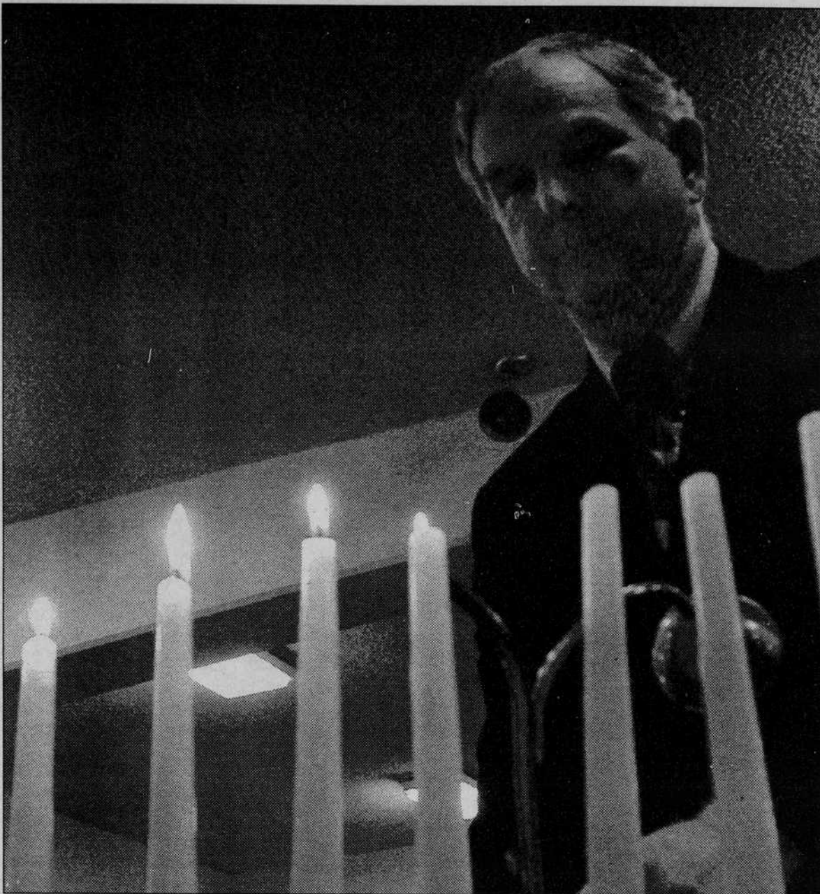
Adam Amato Emerald

State Rep. Al King lights a candle "in hopes that the U.S. Supreme Court will continue to recognize the rights of women," at the Roe v. Wade 29th Anniversary Candlelight Celebration on Tuesday night at the First Congregational Church in Eugene.