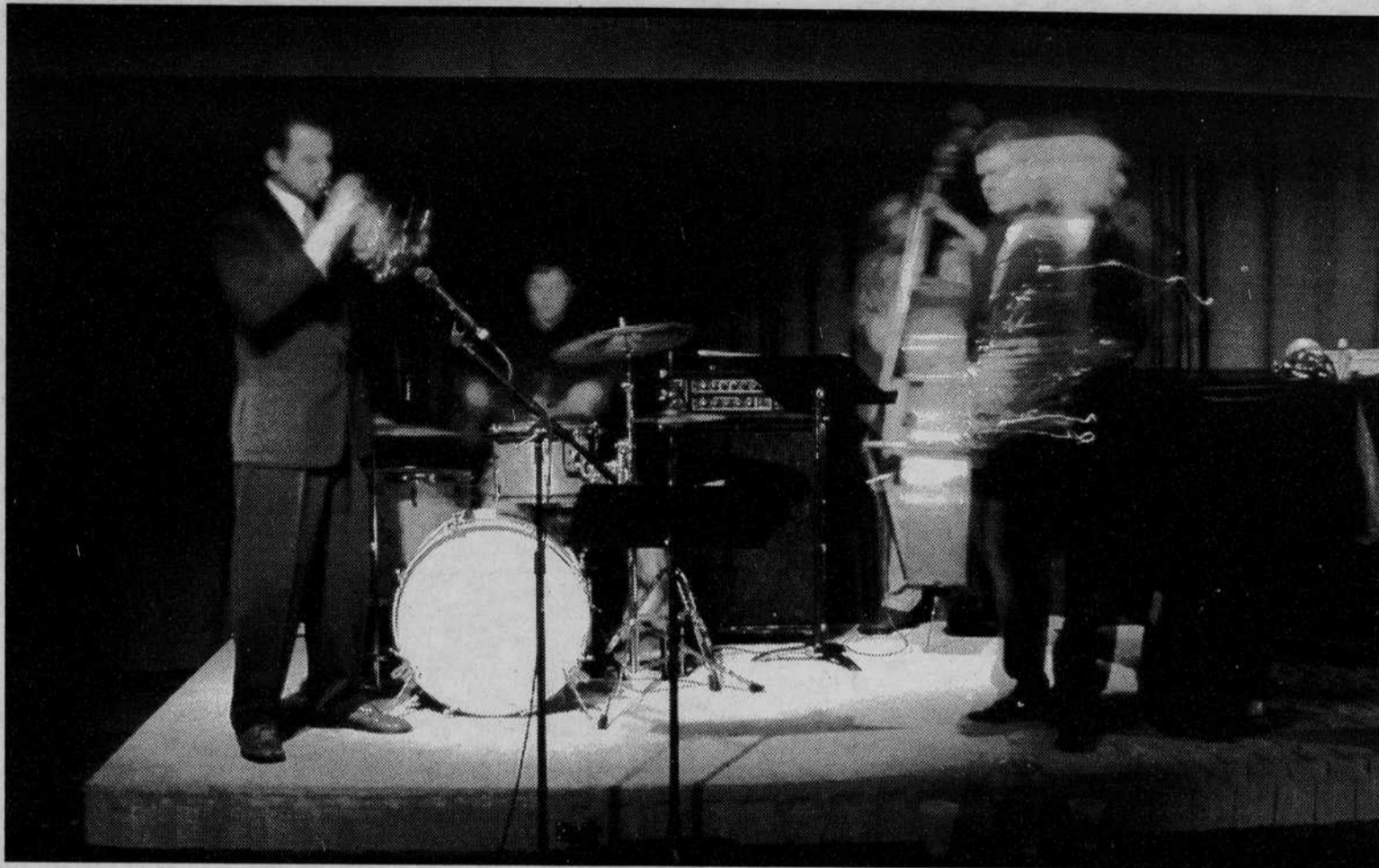
Solein, Wednesday's featured band at Luna, plays its version of '50s- and '60s-influenced original jazz.