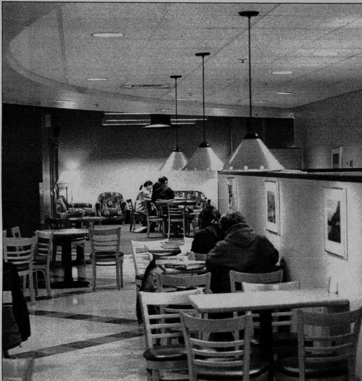
Adam Jones Emerald

The Buzz Coffeehouse is one of the more popular places to grab a cup of coffee, day or night. Not only does it have a great campus location on the ground floor of the EMU, it offers poetry readings every Monday and open mic night every Friday, as well.