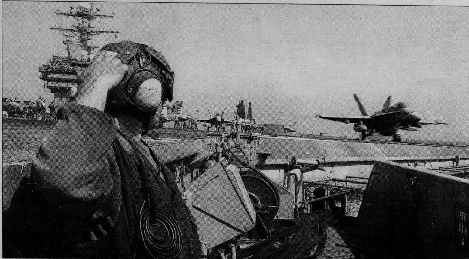
An F/A-18C Hornet is launched Sunday from the aircraft carrier USS Carl Vinson, operating in the Arabian Sea. The carrier is part of Operation Enduring Freedom, a strike against terrorist training camps and military installations of the Taliban regime. The strikes are designed to disrupt the use of Afghanistan as a base for terrorist operations.

■ Sunday's military response to terrorism is just the beginning, according to President Bush