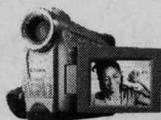
Canon ZR20 or ZR25 MC Camcorder