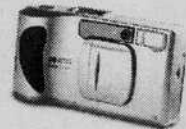
HP 315 Digital Camera