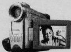
Canon ZR20 or ZR25 MC Camcorder