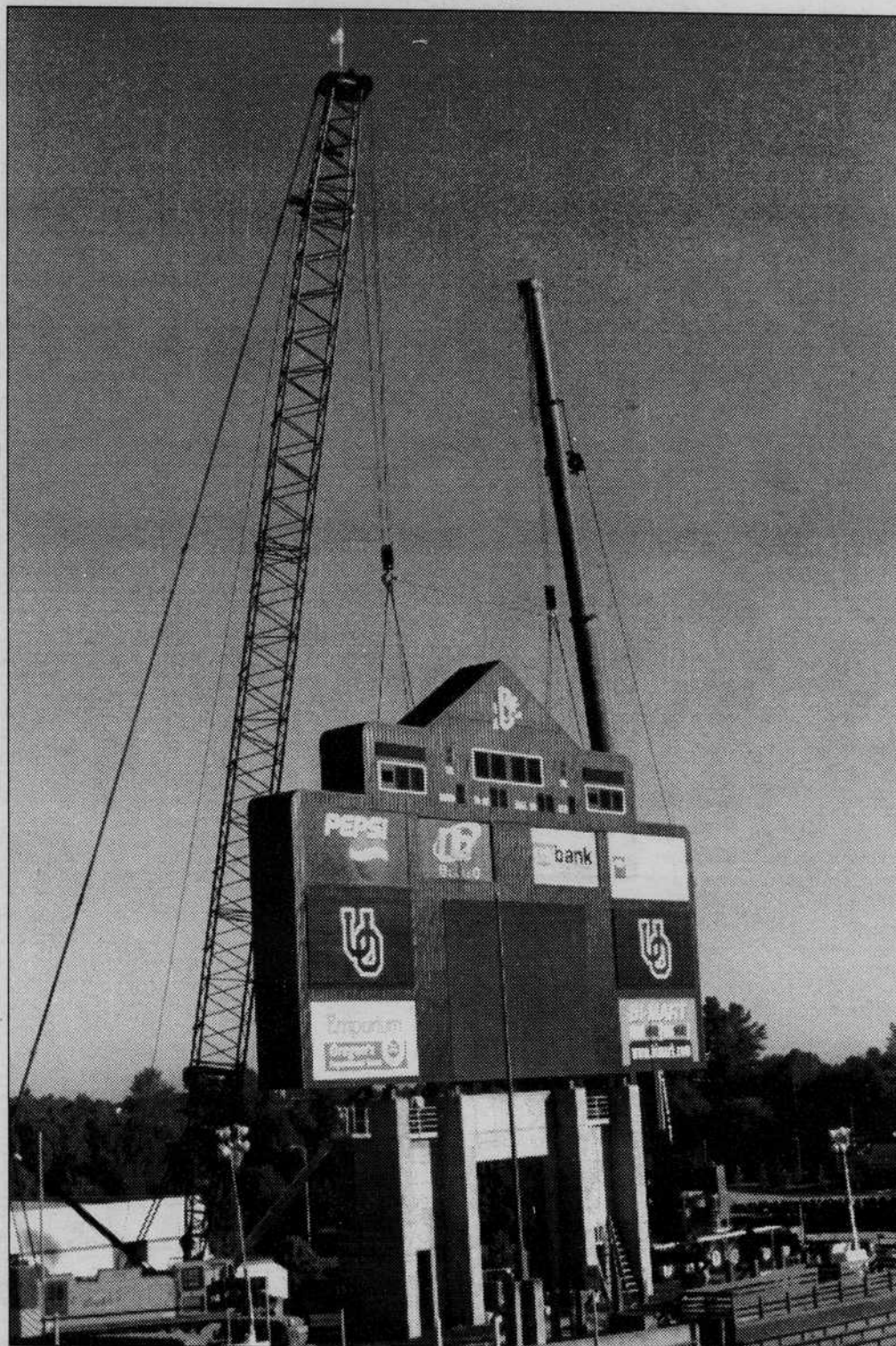
Jessie Swimeley Emerald

A construction crew moves the Autzen Stadium scoreboard from its lower level to its new, higher perch. The scoreboard was moved to accommodate next year's final phase of expansion, which includes the addition of seats to the end zone.