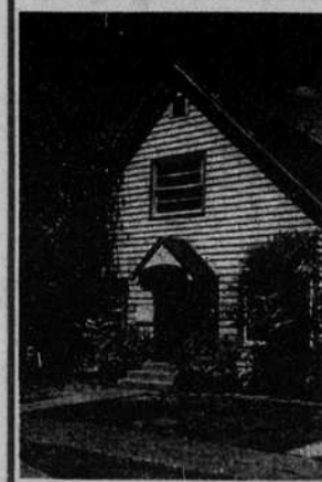
469 & 475 E. 15th Street between Mill & Ferry